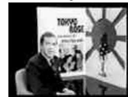
Morley Safer introducing the June 24, 1976 60 Minutes segment on Iva

trolled Far Eastern radio." 62 Already knowing she was not Tokyo Rose, "Six months after Iva's arrest, the Eight Army's legal section reported, "There is no evidence that [Iva Toguri d'Aquino] ever broadcast greetings to units by names or location, or predicted military movements or attacks indicating access to secret military information and plans, etc., as the Tokyo Rose of rumor and legend is reported to have done." 63 The office of the U.S. Attorney General was aware of this report, and it was their recognition that "the identification of Toguri as 'Tokyo Rose' is erroneous," that led to her rapid release from custody on October 25, 1946. 64 Yet less than two years later, United States Attorney General Tom Clark authorized Iva's indictment for treason by federal prosecutors who knew she was not Tokyo Rose and that she had never committed treason. Federal prosecutors and other government agents continued the charade by concealing their knowledge of her innocence all through her trial, her appeals process, and while the Immigration Service attempted to deport her after she had finished her prison sentence.