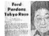
Newspaper story about President Ford's pardon of Iva on January 19, 1977.